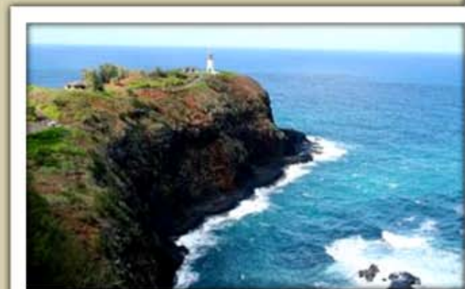
God's glory as seen in the Hawaiian landscape refreshed me more than I ever imagined.